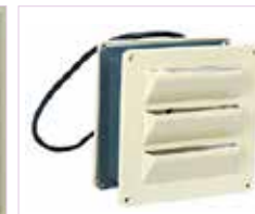
Pressor Relief Port