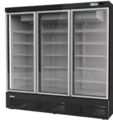
Plug-in Multi Door - Freezer & Chiller SL2D 131 / SL3D 197 / SL3D 210 SM2D 123 / SM3D 183 / SM4D 245