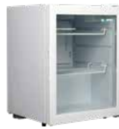
RF 60 G