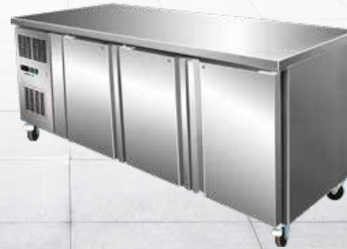
CGN 3100 C / EGN 3100 C/F UC 1801 C / UC 1802 C