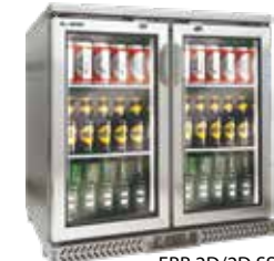
EBB 2D/2D SS