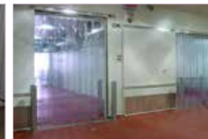
Strip Curtain (as required)