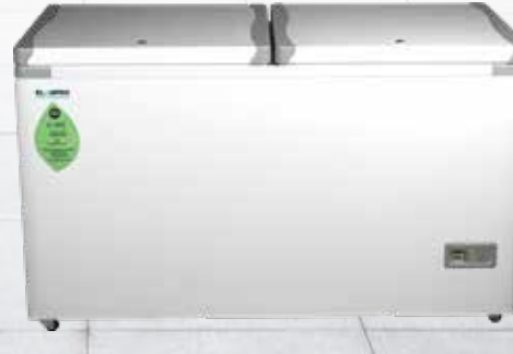
EF 335 DD