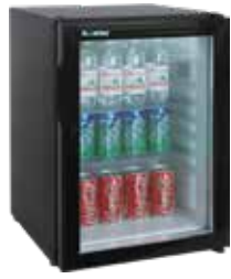
RB 41 G

Elanpro Minibars are designed keeping in mind the room aesthetics and noiseless cooling performance for your discerning guest.