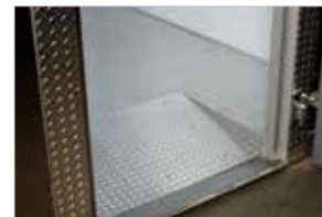
Internal Ramp (used where sunken flooring not available)