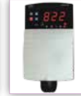
Digital Temperature Display