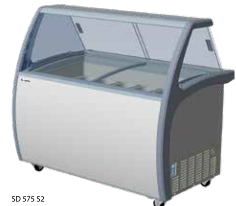
SD 575 S2