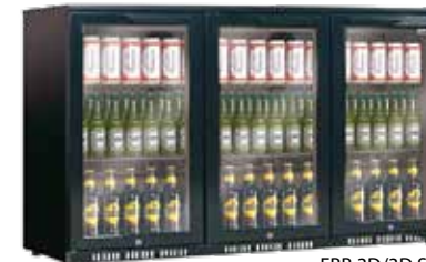
EBB 3D/3D SS